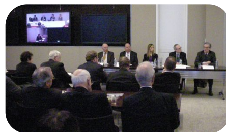
video-linked transatlantic roundtable of experienced emergency arbitrators and counsel in London and New York